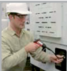
Well visible LC-monitor