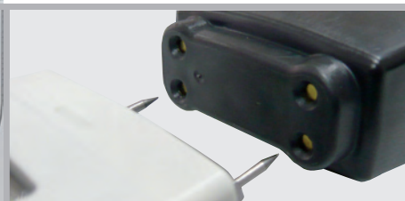
Protective cap with self-test function