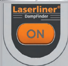
Simple one-button operation