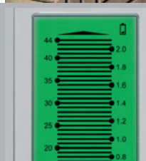
Large, clear LCD