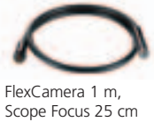
FlexCamera 1 m, Scope Focus 25 cm