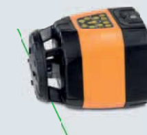
1 Supplied with kit